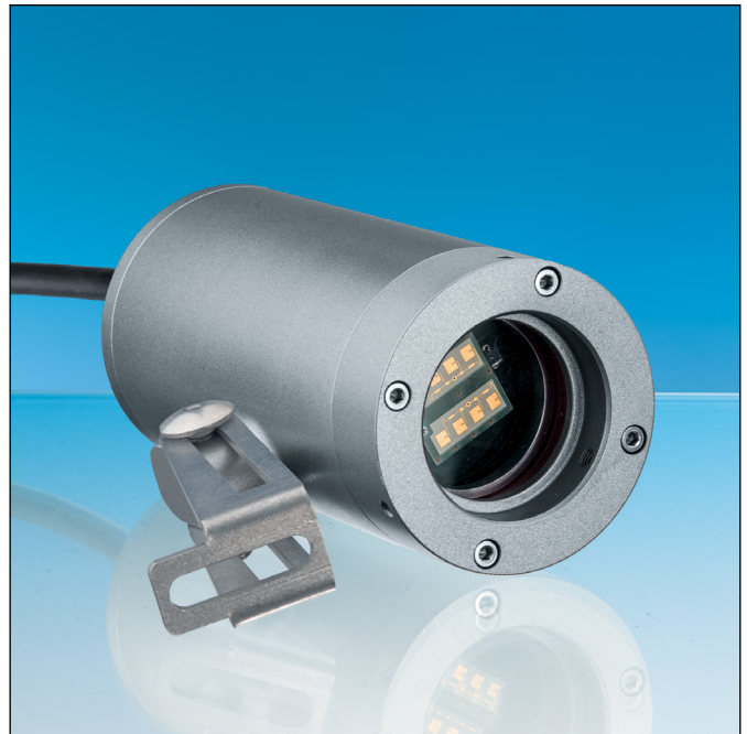
Lumiglas signalling device M55-BD-Ex